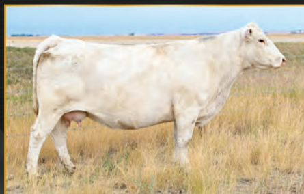
Dam: CEDARLEA UZA 44Y