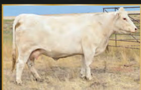
Dam: CEDARLEA SARATOGA 47C