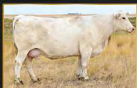
Dam: CEDARLEA STELLA 2A