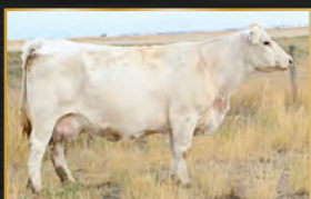
Dam: CEDARLEA WILLOW 52A