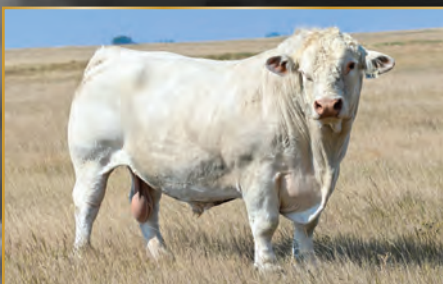
Sire: CEDARLEA THE COUNT 175F