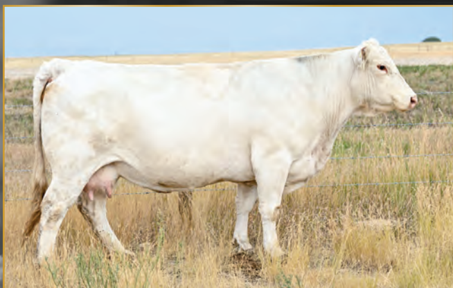
Dam: CEDARLEA UCALA 70A