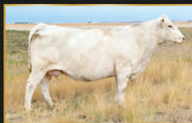
Dam: CEDARLEA UZA 44Y