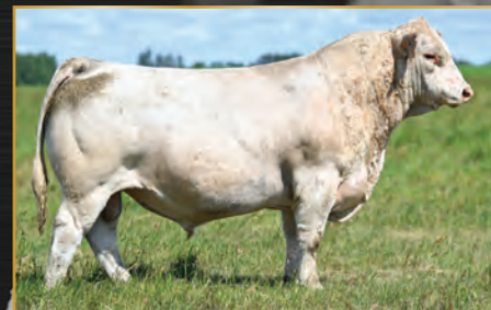
Sire: CEDARLEA TAPADERO 17G