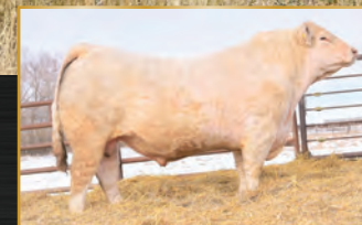
SOD: CEDARLEA EPIC 14E