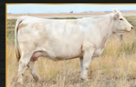
Dam: CEDARLEA SHOWGIRL 46D