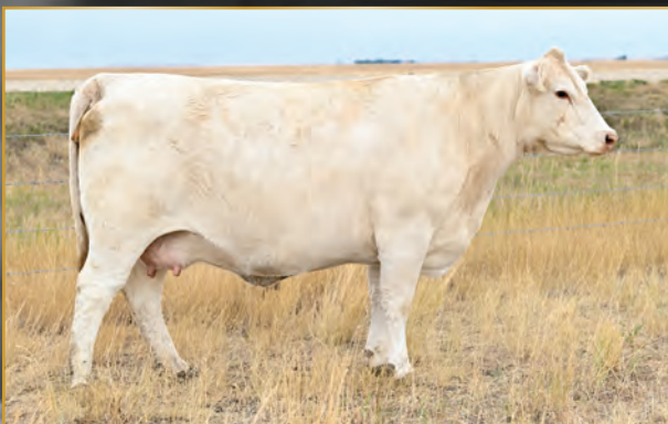
Dam: CEDARLEA TINSEL 68F